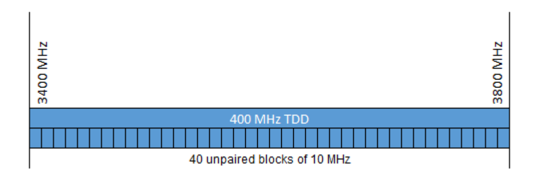
Figur 2: 3.6 GHz band

There is a total of 400 MHz available in the 3.6 GHz band, divided into 40 blocks of 10 MHz.